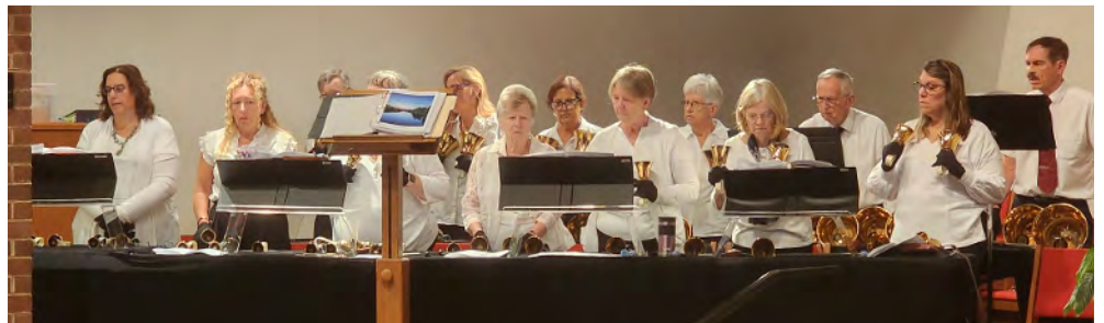
The Gloria Ringers and percussionists played "Bwana Asifiwe" on International Sunday, September 29.