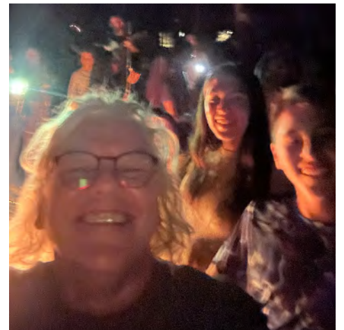
Our youth enjoyed a hike on a beautiful Sunday in October.